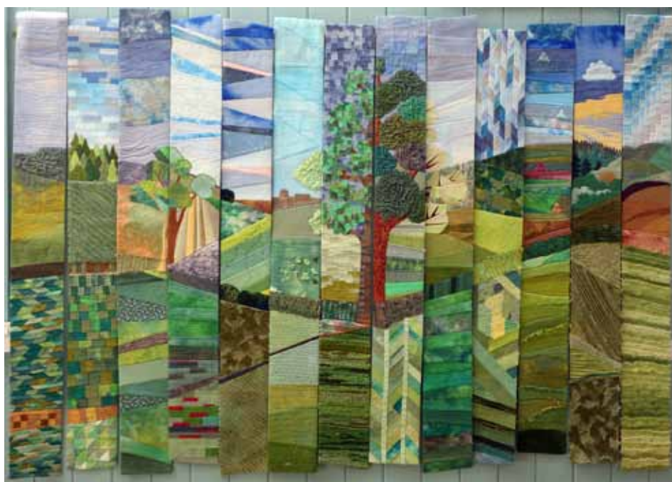
Above: The View from Here , group quilt by New Horizons

Group membership has fluctuated over the years, being as high as twenty and as low as eleven. The average is somewhere in between – we currently have fifteen members. We don't have a lower limit but we try not to let the group get too large. Two of the original members are still part of the group.